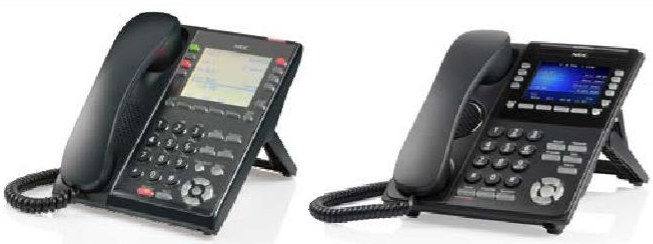
IP Telephones: Easy call control from the office, remote office or home office