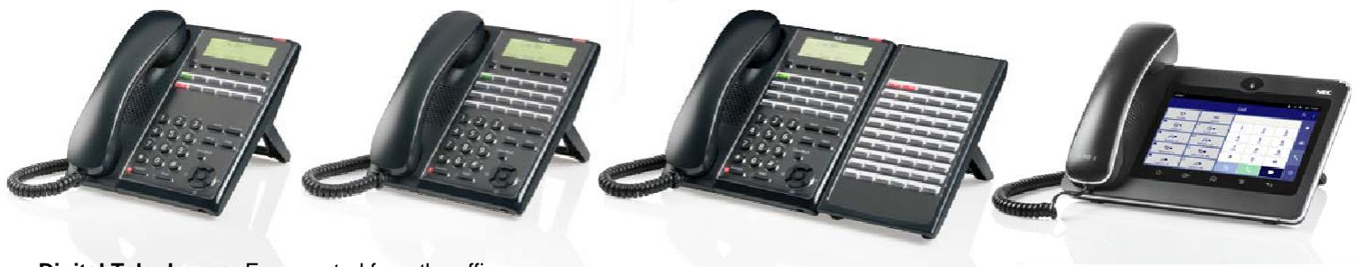
Digital Telephones: Easy control from the office