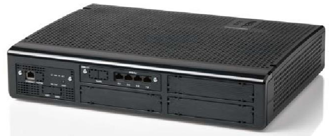
SL2100 Communication Server: Scalable from 1 to 112 users